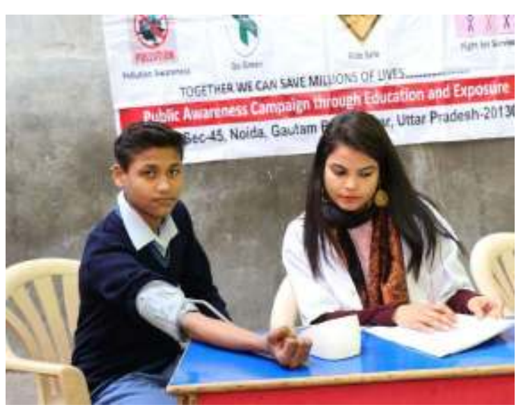
Caring for around 870 kids in different schools . Brighter and healthy destiny of our nation.