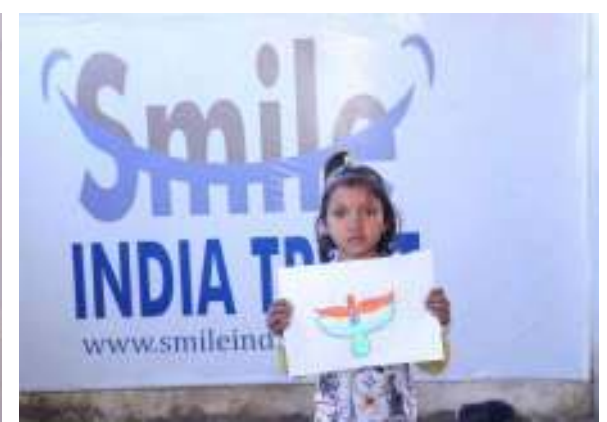
Celebrating Republic Day was all about enjoying and feeling proud of the nation's glory and grandness.