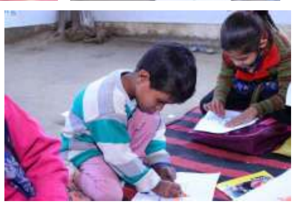
Drawing Competition held on Republic day, patriotic fervour of children and spread happiness with these less fortunate ones.